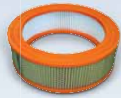
HEPA filter ref. OSC 208-3

OSCIMED vacuum cleaner for PSV saw with European plug: ref. OSC 206-V00 OSCIMED vacuum cleaner for PSV saw with British plug: ref. OSC 206-V00-UK OSCIMED 120V/60 Hz vacuum cleaner for PSV saw with U.S. plug: ref. OSC 206-V00-US