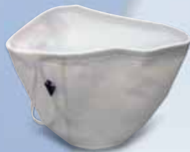
Polyester filter ref. OSC 208-1