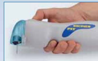
Easy to use with one hand even with the dust extraction