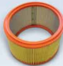
HEPA filter ref. OSC 208-2