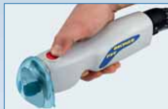
Simple sensor switch access