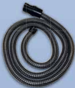
Vacuum cleaner hose ref. OSC 311