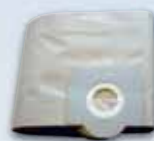
Dust bag ref. OSC 207