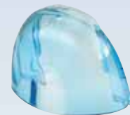
Vacuum nozzle ref. OSC 320